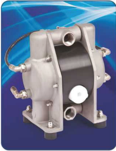
Metal pump with heating jacket.