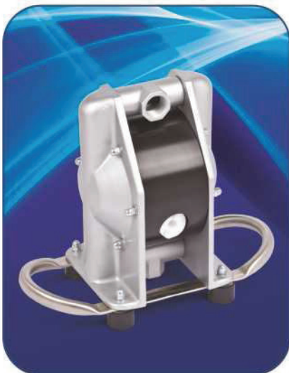
Metal pump with handle for drum option.